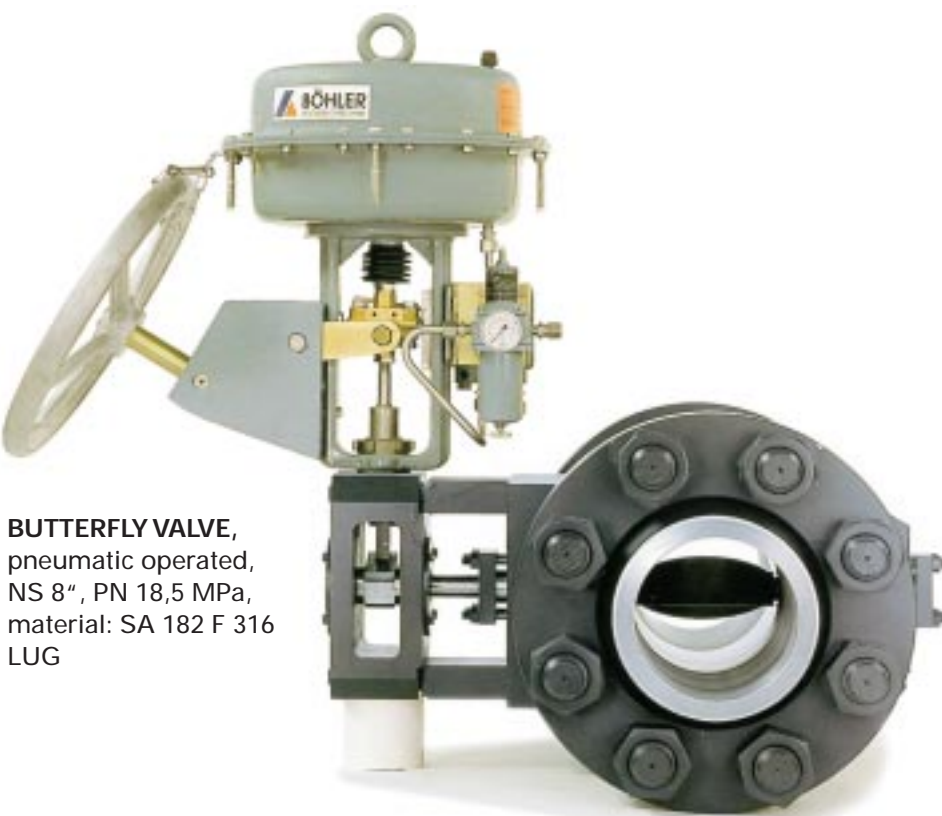
BUTTERFLY VALVE, pneumatic operated, NS 8", PN 18,5 MPa, material: SA 182 F 316 LUG

Valves and fittings are made exclusively of forged materials. The exact knowledge of process technologies guarantees optimum function and long service life of the fittings. The Böhler HDT Valve Production programme includes all valves, fittings and accessories needed in an industrial plant. Prefabricated high pressure pipes (isometrics) are a further strong point in the Böhler HDT product range. As a company of international renown, Böhler HDT are thus in a position to produce any component desired according to determined specifications and connection variants. Certification according to ISO 9000/9001 as well as an integrated quality assurance system guarantee constant production quality. Böhler HDT export their products to all countries in the world – their market share in the USA and Canada in the field of fertilizers is approximately 50%.